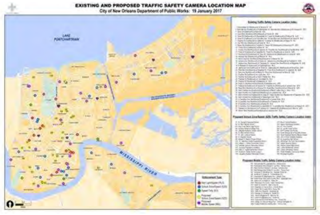
Figure 1: City of New Orleans 2017 map of red light and speeding cameras

The TCSP, started in 2007 under Mayor C. Ray Nagin, has evolved through three mayoral administrations. The first cameras were installed in January 2008 at six locations. The program reached its peak in late 2017 under the administration of Mayor Mitch Landrieu with 111 stationary cameras, as well as mobile cameras deployed throughout the city. 4 (See Figure 1 for a 2017 map of the traffic cameras.)