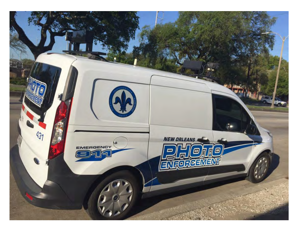
A mobile traffic camera van parked in New Orleans.

ATS programmed the traffic cameras based on the City's responses to the "Business Rules Questionnaire," or BRQ, a document the contractor used to determine system settings and define which driver behaviors resulted in citations. A vehicle entering an intersection after the light had turned red and proceeding completely through the intersection was cited. A driver received a citation for turning right on red if the vehicle did not come to a complete stop before turning right.