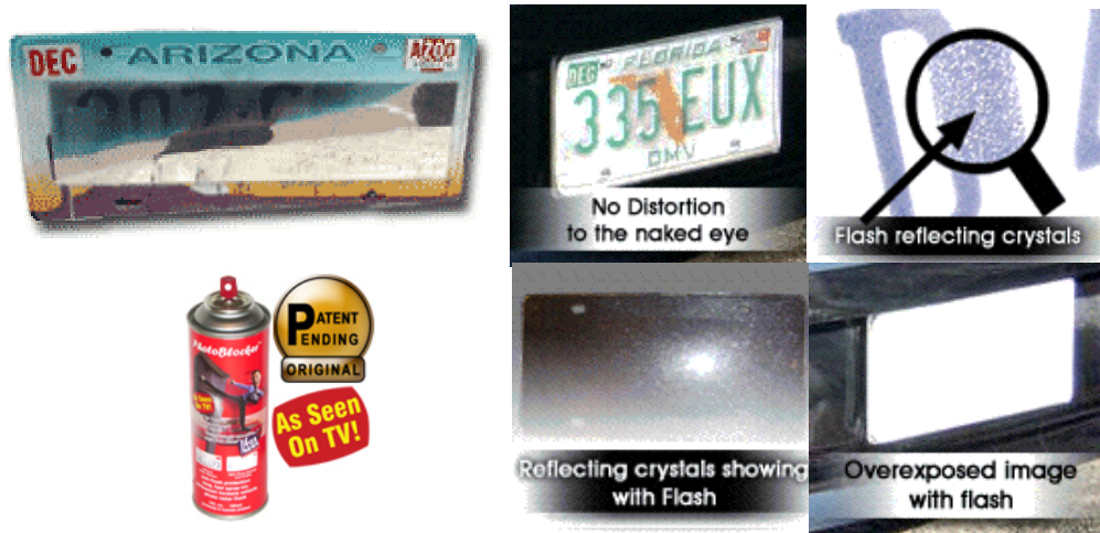
Figure 5: License Plate Covers and Spray

Photo on bottom left from spray ad; other photos from ads for covers.