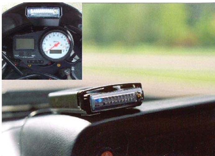
Figure 7: GPS Speed Camera Location System

These [devices] constantly know where you are, using the GPS satellites, and have a database of all known camera, speed trap, accident blackspot locations and warn you as you approach them. They don't pick up radar, so they don't give you false alarms. As more Gatso's etc [brand of photo speed camera] are added every day (4,300 of them in March 2004 [in Great Britain]), the manufacturers need to keep updating their database to keep your list up to date. Most of these GPS devices also record the common places for mobile speed traps. As they don't pick up radar they won't defend you against a policeman using a radar gun in a new location, but they will against the 4,300 cameras that are currently installed. All of the devices need to be connected to the manufacturers every few weeks to update their data with new sites. They all do this by using a modem to connect to the Internet/direct and downloading the new data. Some of the units come with a modem and others assume you have one. (Gander 2004)