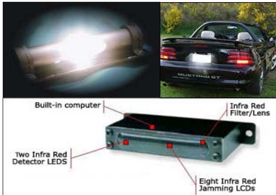
Figure 4: Photo Jammer and Laser Jammer

Top photos from photo jammer ads; photo on bottom from laser jammer ad.