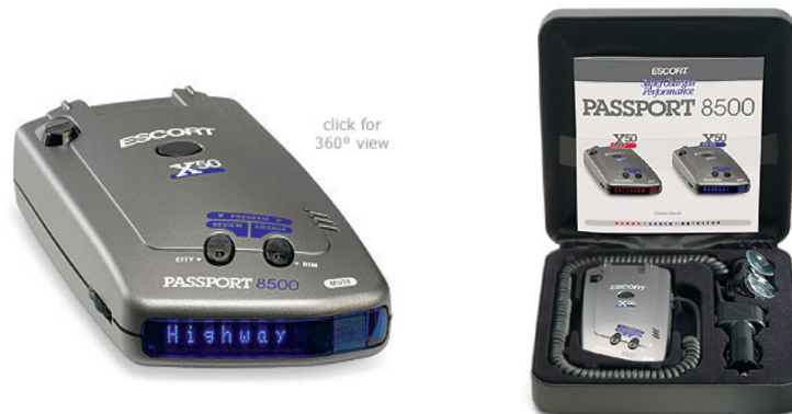
Figure 6: Radar Detector