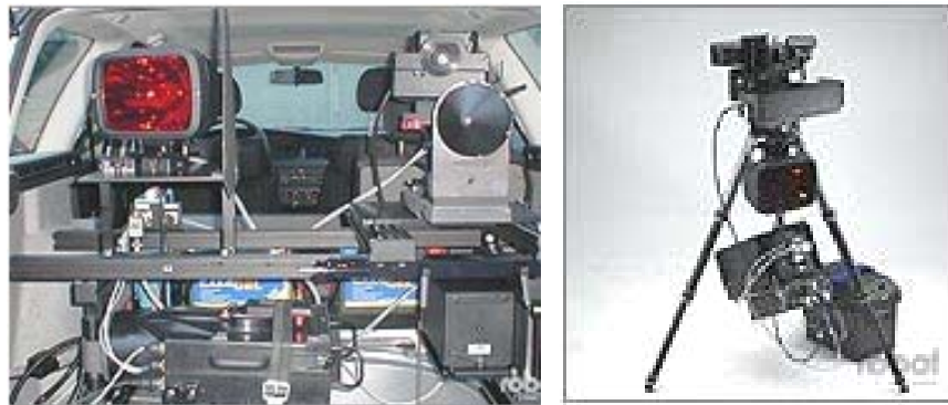
Figure 2: Mobile Speed Camera Equipment

The concept behind mounting a camera/sensor in a van is somewhat similar to a typical law enforcement officer using a radar gun in his/her patrol vehicle to issue speeding citations (see Figure 2). The ability to automatically record violations in the mobile photo enforcement van and later issue citations can be said to increase the efficiency of such a unit versus a patrol vehicle. It is important to note that that the mobile unit is quite limited in its function whereas an officer in a radar-equipped patrol vehicle can instantly switch to other safety functions based on observed information or radio calls. These include helping stranded motorists, removing drivers under the influence, and answering radio calls for assistance for a wide variety of needs. Conversely, many municipalities do not use police officers to operate the mobile vans, but use technicians instead.